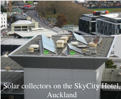
Solar collectors on the SkyCity Hotel, Auckland

NEWS AND INNOVATION FROM ECOSOLAR, LEADERS IN SOLAR WATER HEATING