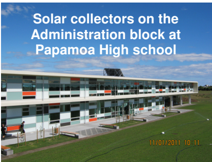
Solar collectors on the Administration block at Papamoa High school