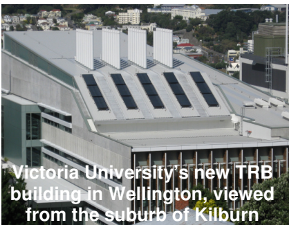
Victoria University's new TRB building in Wellington, viewed from the suburb of Kilburn