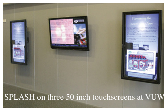
SPLASH on three 50 inch touchscreens at VUW

If you haven't yet visited the SPLASH Monitoring website at www.splashmonitoring.com , please take time to look around and familiarise yourself with this great online solution. SPLASH Monitoring was developed here at Energy Conscious Design and is currently being specified on many of the larger commercial projects we are involved in. SPLASH Monitoring is an online solar system monitoring and fault diagnosis service with many other benefits. SPLASH Monitoring is not only suitable for commercial projects it is also applicable for residential systems and has proven itself on many occasions, often paying for itself in a matter of months and in some instances in less than a month.